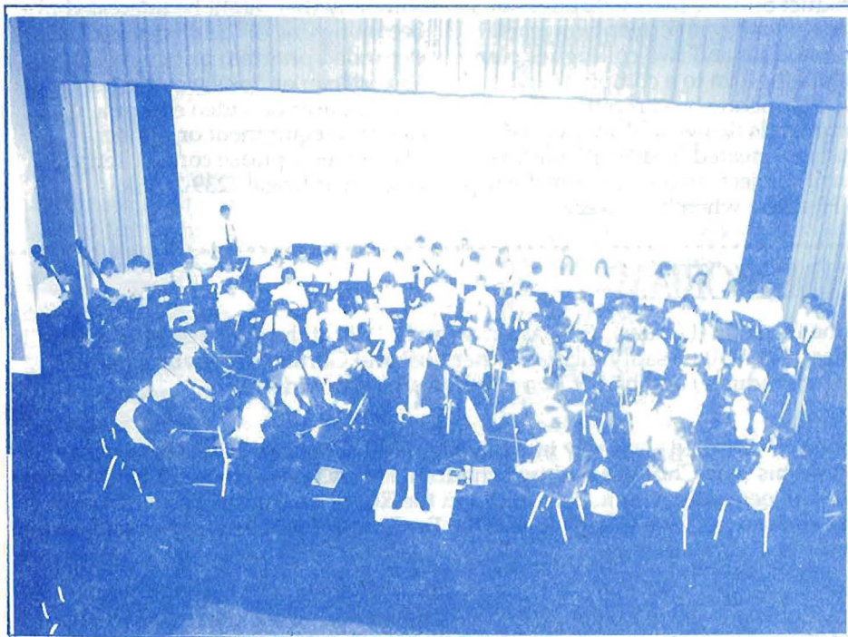
1950-51 North Orchestra visits Lisgar.