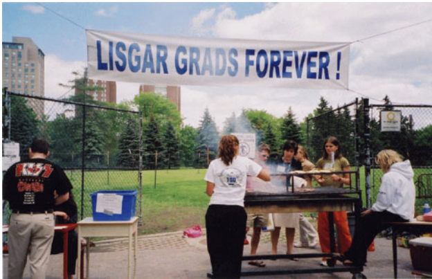
Lisgar Athletics Association holds barbecue