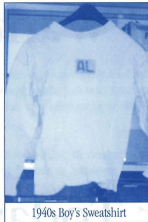
1940s Boy's Sweatshirt