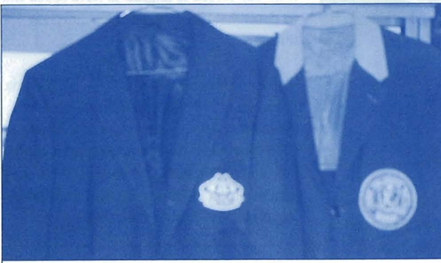
Band and Orchestra Jackets