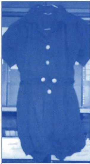
1950s Girl's Gym Bloomers