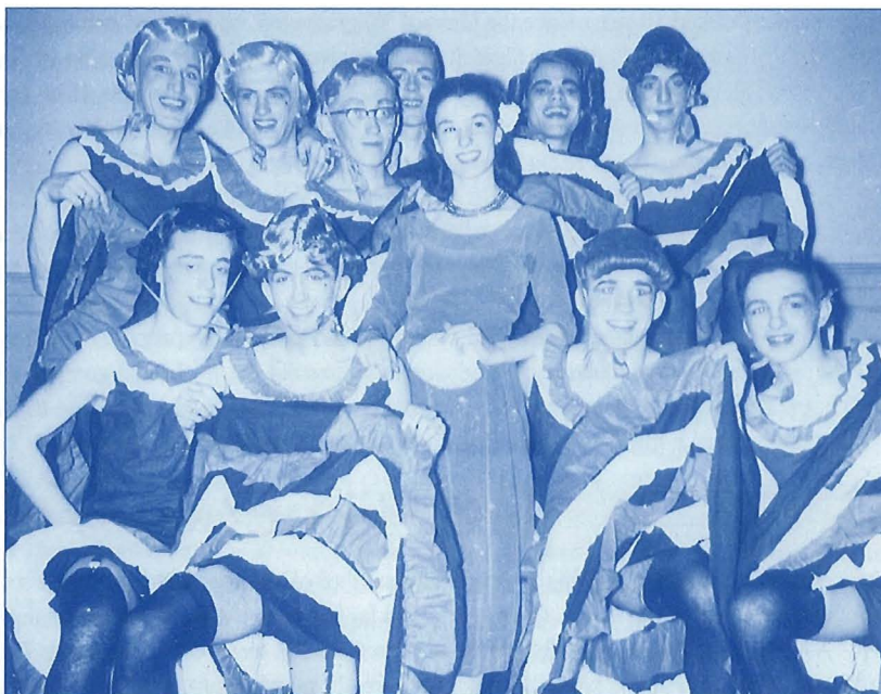
Lisgar Boys Hi-Y, 1953-54